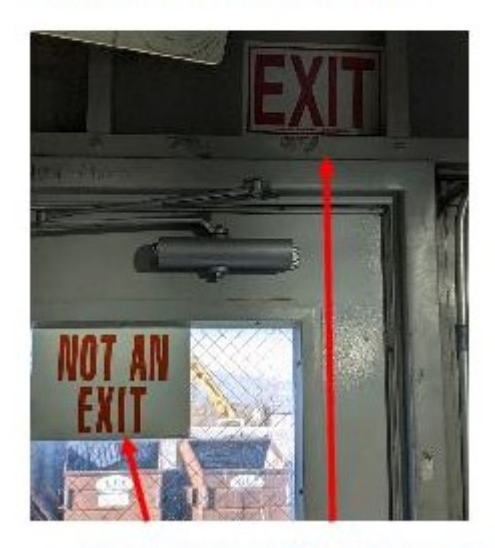
Not correct - Labeled both as "Exit" and "Not an Exit"