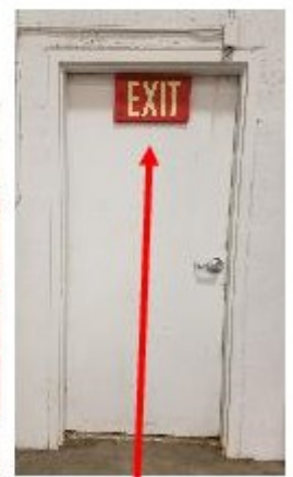
Not correct — Exit sign on door, not visible is door is open