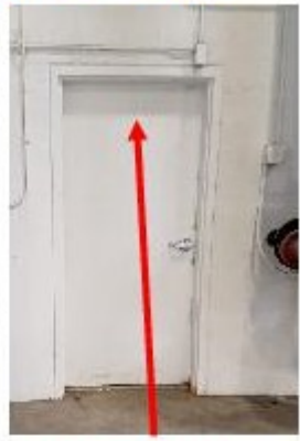
Not Correct - No marking at door