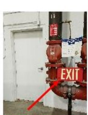
Not Correct marking needs to be at door or arrows